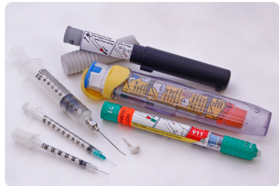
Examples of medical sharps.