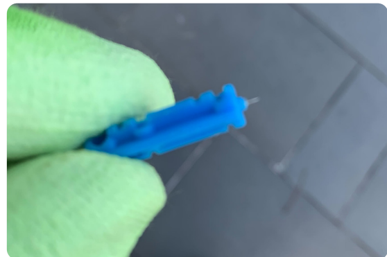
! Look out for non-obvious sharps like this lancet.